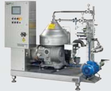
Alcoholic beverage - Juice wine and sparkling wine clarifier