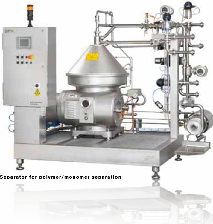
Industrial – Separator for polymer/monomer separation

By partnering with SPX, you can achieve improved performance efficiency, exceptional lifetime value in terms of initial investment, operational performance and ongoing service and reduced maintenance costs.