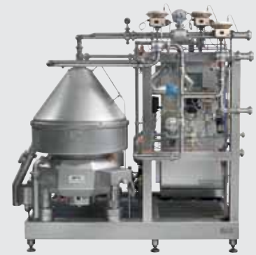
Dairy - Milk Separator with automatic milk and cream standardization system

We also offer a wide range of separation process accessories enabling you to meet your separation and clarification needs from a single supplier.