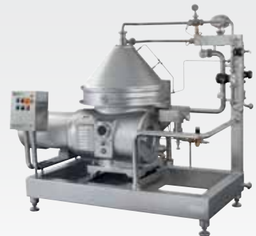
Biotech – Clarifier for lactic acid bacteria recovery